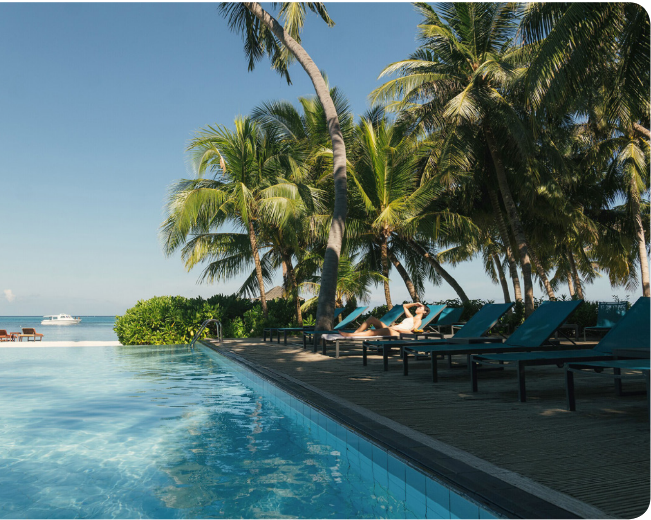
Main swimming pool Outdoor Pool